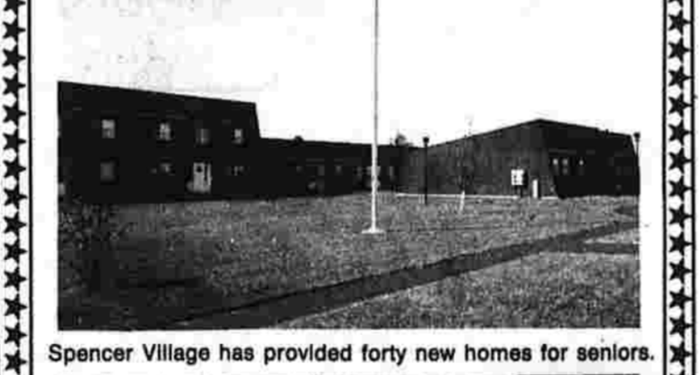
Spencer Village has provided forty new homes for seniors.