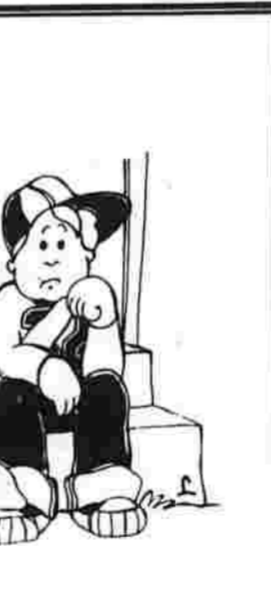
Even small businessmen have cash flow problems.

"Parenting Children emotional needs of the parent and the child, family and social relationships, Family Life Education siblings and planning workshop, sponsored by Catholic Family Services on Saturday, Oct. 20 from 9 a.m. to 2:30 p.m. at the