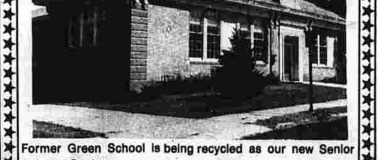
Former Green School is being recycled as our new Senior Citizens Center.